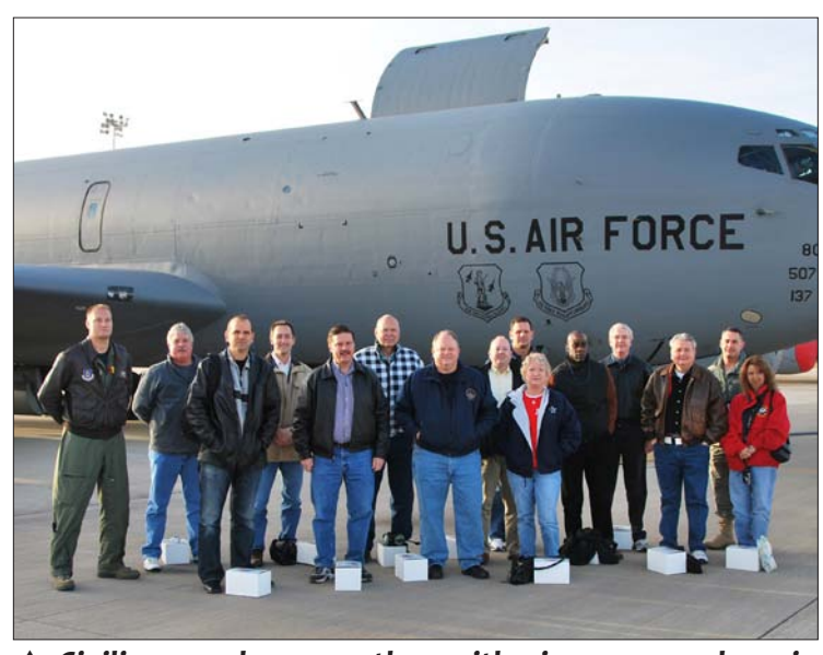
▲ Civilian employers gather with aircrew members in an understanding of how their front of a KC-135 Stratotanker before taking off for an support affects the overall employer support flight on December 1, 2010.

their employers by filling out November 2011 UTA.